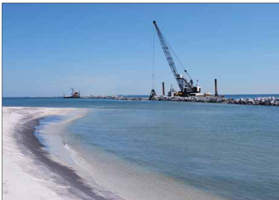
Figure 3. Crews blockade the inlet with riprap at Katrina Cut on Dauphin Island, Alabama. This view is from the uninhabited west end of the island, looking across the inlet toward the heavily developed east end.

likely to occur in locations where sand berms or other oil-spill mitigation operations block or restrict inlets. Profound alterations to sediment and biological transport routes are possible whenever local hydrology is manipulated (Chaibi and Sedrati 2009). The reduction of inlet volume decreases the exchange of water and sediments during tides (Kraus and Militello 1999). This, in turn, affects flow velocities, typically resulting in scouring along bank margins, while near-shore wave dynamics often change as well (Komar 1996). The closing of inlets can modify the salinity, oxygen level, and turbidity of back bays. Associated ecosystems often experience large fish kills or other radical shifts toward new ecological states, as physical and chemical parameters adjust to a decrease in mixing throughout the water column (Goodwin 1996). If inlet restriction is absolutely necessary, it should aim to minimize the impacts on local hydrology and ecosystem function.