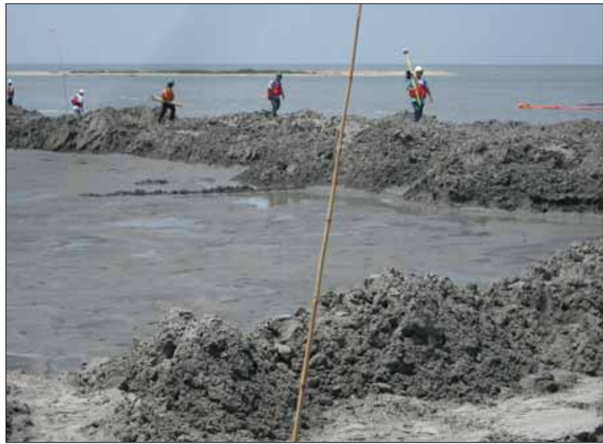
Figure 2. Building sand berms along the Louisiana coast.

Decisions to construct sand berms, fill inlets, or divert freshwater as protective measures against encroaching oil should be based on scientific knowledge and experience, and should take into account long-term restoration and management plans. To the best of our knowledge, there are no documented examples in the peer-reviewed literature of the effectiveness of these methods in mitigating oil-spill impacts on coastal ecosystems. The role played by natural barrier islands in reducing erosion rates of inland coastal margins has been extensively investigated in this region (eg Stone and McBride 1998); however, there is little evidence of the successful use of constructed sand berms for oil protection in the literature (Froede 2007). The absence of evidence to support or refute the effectiveness of these methods in mitigating coastal ecosystem oil impacts underscores the importance of involving the scientific community in decision making and the integration of any coastal oil-spill mitigation strategies into existing coastal restoration plans. Below, we outline scientific and technical considerations that